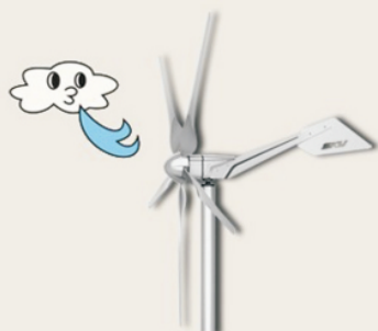
Sky series 1600W wind turbine power diagram